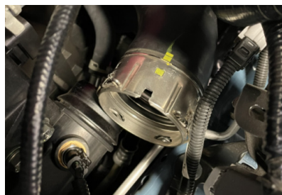
Tacoma/4-Runner/LC250/GX550 Intake Tube

Torque 9/16" nut to 120-125 ft/lbs. w/ red loctite